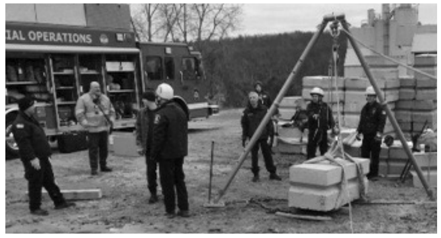
The Fire Departments of Enfield Special Operations Division is hard at work during a recent training exercise. All five of the Town's fire districts are represented on this technical rescue team.

Through the years, the Special Operations Division has responded to numerous technical rescues within Enfield and surrounding communities. Some of these calls have involved vehicles embedded in buildings, building collapse due to snow, trench rescue, various rope rescues and tornado response, to name a few. Currently, the team consists of 25 members who gather to train monthly on any one of the technical rescue disciplines. The photos below were taken during a training this fall.